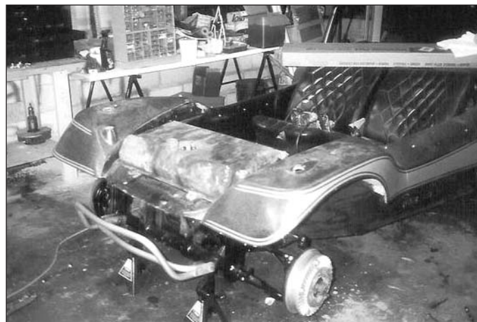
At left: Alan's buggy in the shop undergoing transformation. Below: All shined up to show, the Allison-Daytona buggy gleams at the 2005 Labor Day Car Show in Lafayette, GA.

Alan's buggy is a superb example of the Allison/Daytona buggy and is a sight to behold on a sunny day with the metallic gold flecks reflecting in the sun.